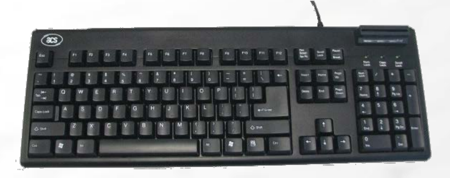
ACR38K - 104 keys