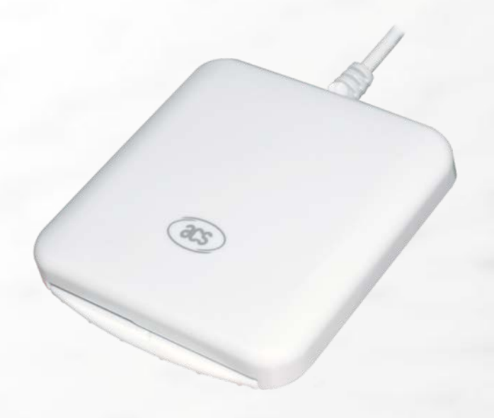
The ACR38 default casing is the Ipod Casing

The ACR38 is the flagship product of ACS. It is a powerful and reliable smart card reader that supports smart cards conforming to ISO 7816.