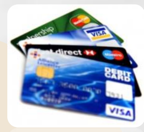
Payment system / e-Purse