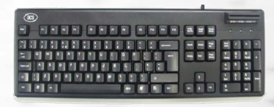
ACR38K - 105 keys

Combine the functionality of a smart card reader and a PC keyboard for easy integration in a PC environment