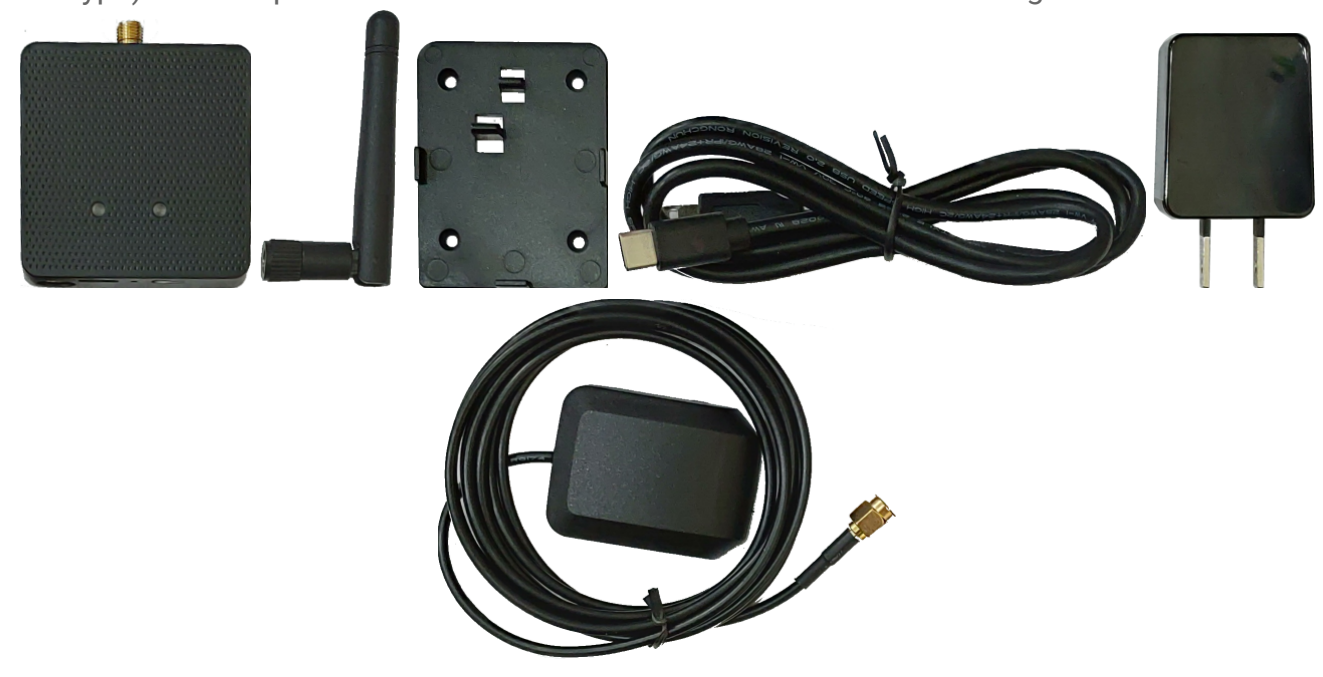
Optional GNSS Antenna

Each main unit has it's accessory, including BLE antenna, 1M USB type-C cable, holder, 2A adapter(US, EU, or UK type) and an optional GNSS antenna is available for iGS03M ordering.